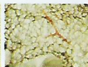
Adipose and Vascular tissue during treatment